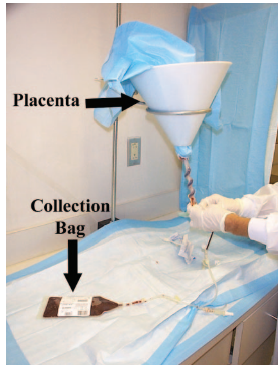
Fig. 2. In vitro collection of cord blood. Moise. Umbilical Cord Blood. Obstet Gynecol 2005.

longed handling times necessary for in vitro collection. 32 A higher incidence of units exhibiting bacterial contamination has also been reported with in vitro collection. 30 From a practical sense, in vivo collection adds minimal time to the delivery process after vaginal delivery. In vivo collection at cesarean delivery increases operative time and can make placental removal more difficult once the uterus has involuted.